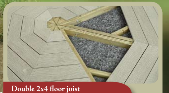
Double 2x4 floor joist