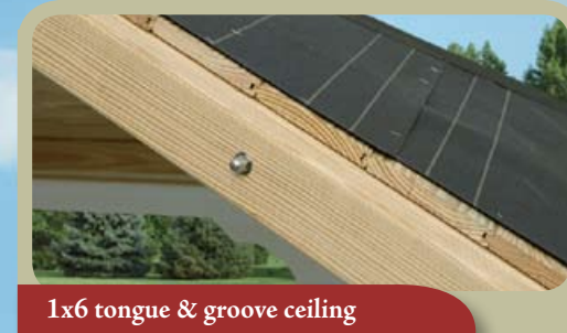
1x6 tongue & groove ceiling