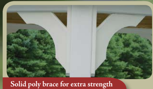
Solid poly brace for extra strength