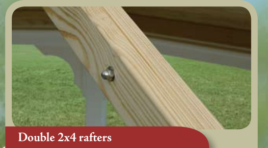
Double 2x4 rafters