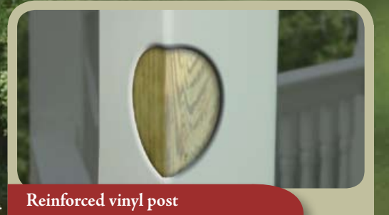
Reinforced vinyl post