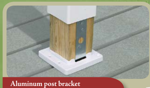
Aluminum post bracket