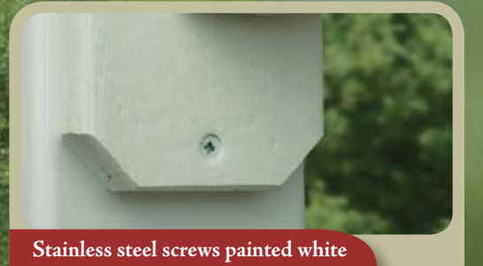
Stainless steel screws painted white