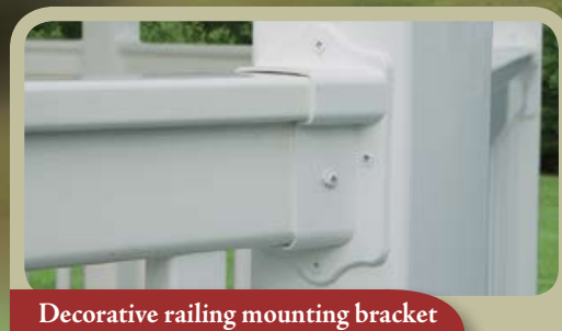
Decorative railing mounting bracket