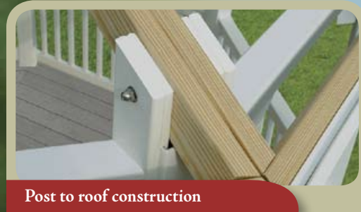
Post to roof construction